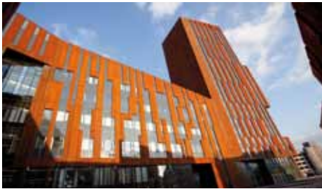
Broadcasting Place, Leeds Metropolitan University

Leeds City Region, which brings together Leeds, Barnsley, Bradford, Calderdale, Craven, Harrogate, Kirklees, Selby, Wakefield and York as a single economic unit, has a population of 2.9 million, a labour force of over 1.5 million and a combined GVA of £48 billion. It is home to over 120,000 businesses and six universities. More than 110,000 people travel to work in Leeds from the surrounding region each day.